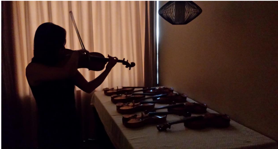
Figure 1: Experimental setting

The output data consist therefore in clusters of instruments and verbal comments upon these categories, which were taken as notes in real time by the first author.