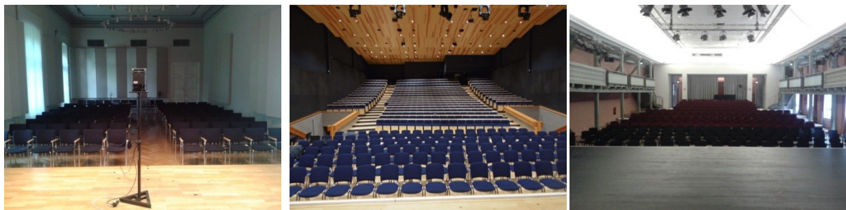
Figure 2: General view of the auralized rooms (BS, KH and DST, respectively)